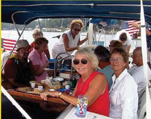
The Party Boat