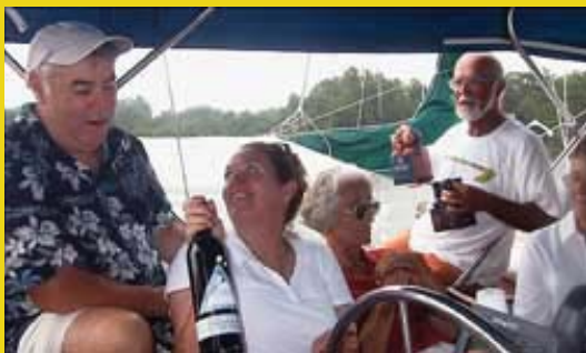
Winners: the Thrashers