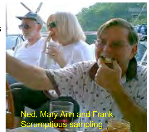
Ned, Mary Ann and Frank Scrumptious sampling