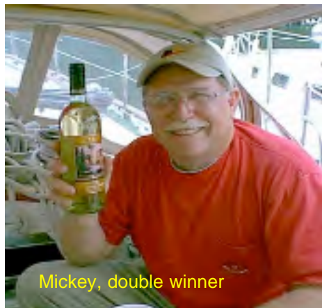
Mickey, double winner