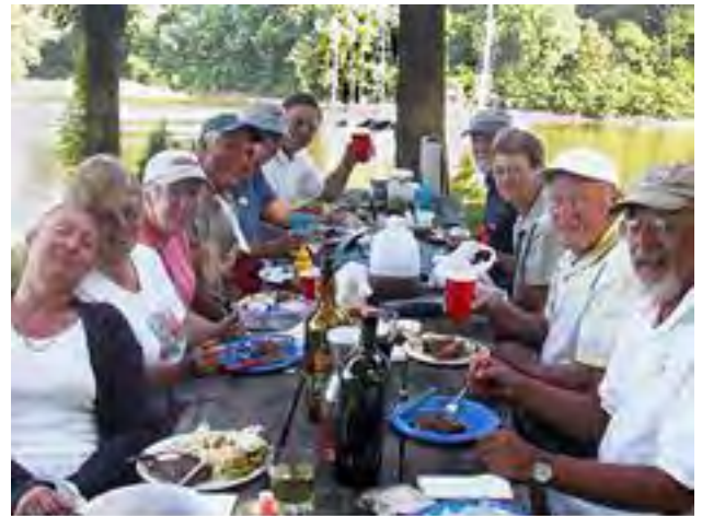
Saturday Night Cookout

when he was just a little squirt.) A few folks dined aboard on Saturday night, but lots of dinghies shuttled folks ashore to take