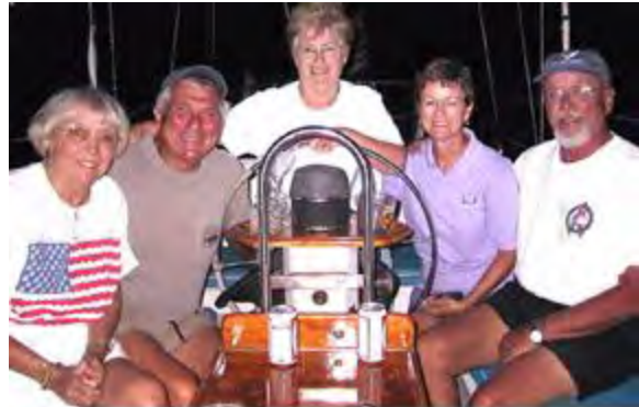
Friday Happy Hour aboard RHYTHM

THE WEATHER REPORT was not very encouraging before the Memorial Day weekend, but lots of folks made their way to Granary Creek for our annual Eastport/CBC Wye Island celebration. On Friday night several early birds arrived and gathered for a fun happy hour. SAVOIR FAIRE, RHYTHM, and WACAJO were there on station as the day dawned a bit overcast, and not particularly breezy. All sorts of craft