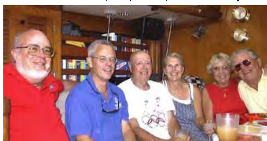
HEY, WHO TOOK THIS PICTURE ?

and then sailed as the wind built up. We anchored just outside Worton Creek. The swimming was excellent.