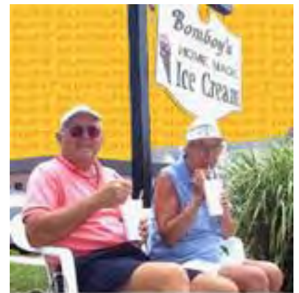
"MMMMM GOOD !"

The last night we had drinks aboard Rhythm as the sun went down in a hazy sky.