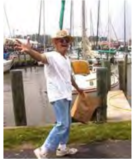
"LET ME ENTERTAIN YOU . . ."