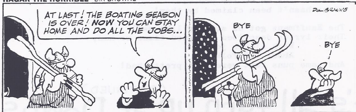
HAGAR THE HORRIBLE DIK BROWNE